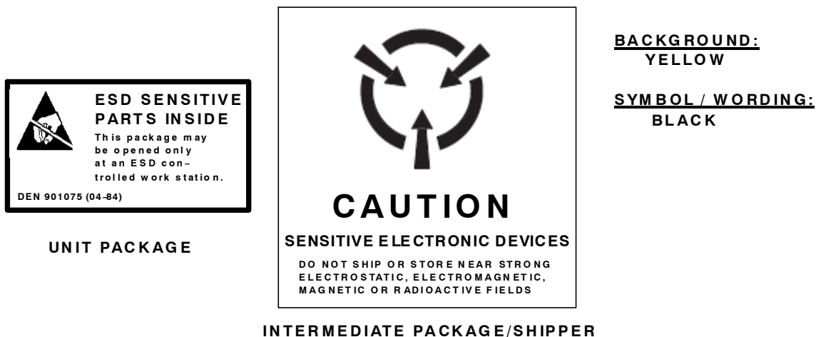
Figure 3. Electrostatic CAUTION Label

Apply WARNING label (Figure 3) to each unit package containing a static sensitive device.