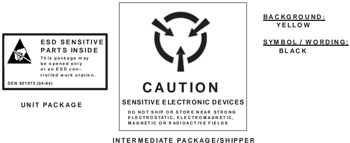
Figure 1. Electrostatic CAUTION Label

3.5.1.1 Electrostatic CAUTION Label – Apply WARNING label to each unit package containing a static sensitive device.