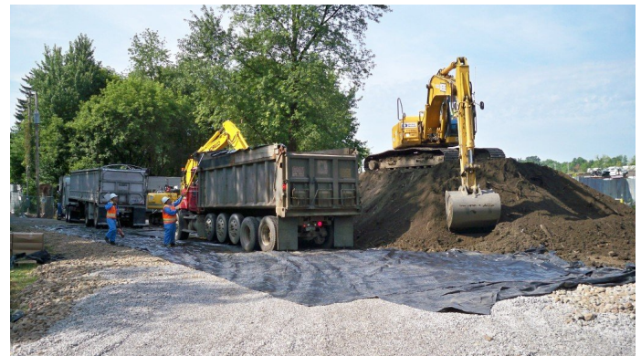
(Above) Loading of materials to go to permitted landfills in Michigan and Ohio (Below - Left) Tarp used to cover materials prior to loading (Below - Right) Installation of by-pass pump system