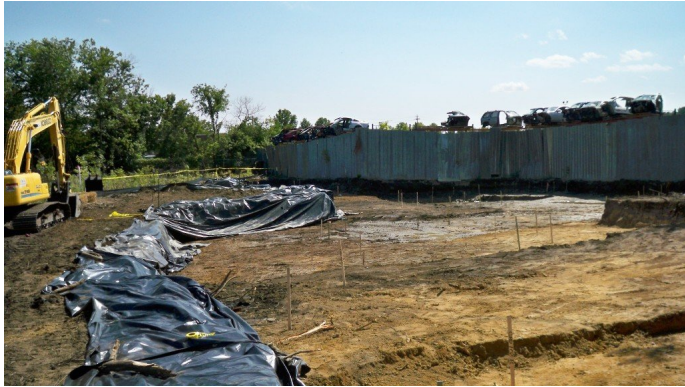
Excavation of the western side