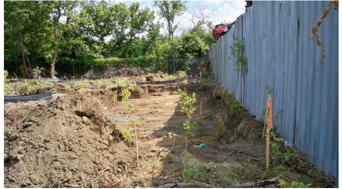
Excavated area showing grid layout