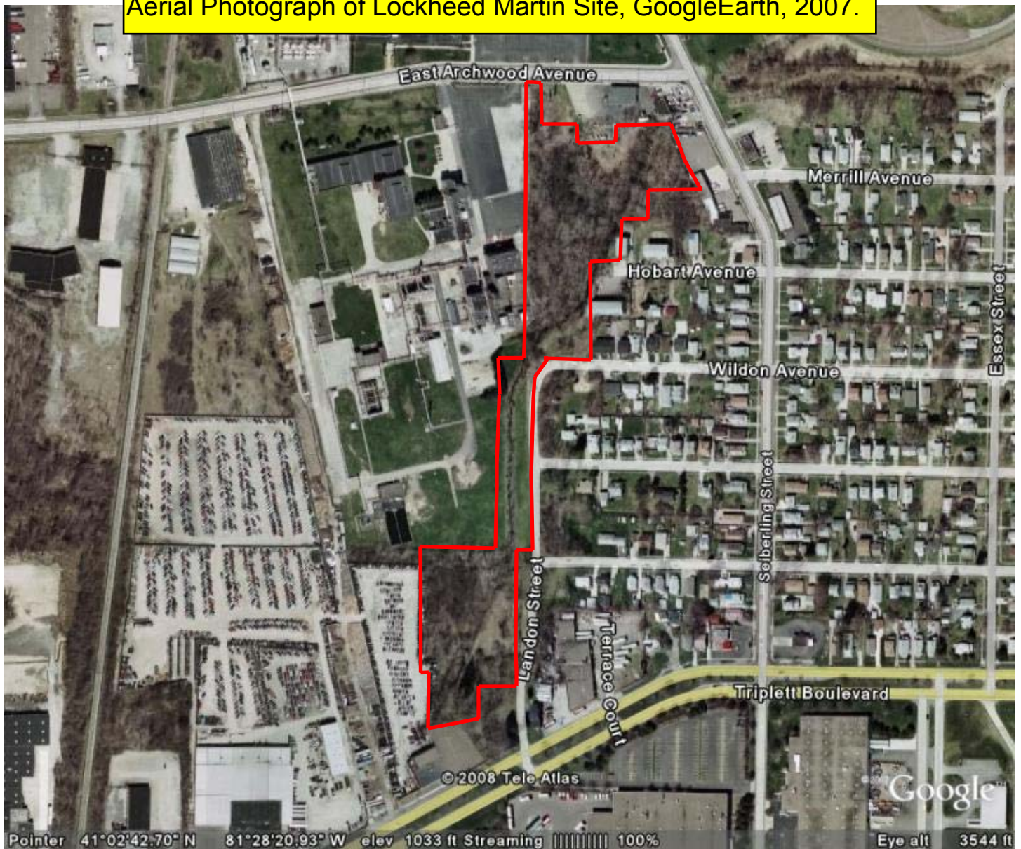
Aerial Photograph of Lockheed Martin Site, GoogleEarth, 2007.

Pointer 41°02'42.70" N 81°28'20.93" W elev 1033 ft Streaming 100%