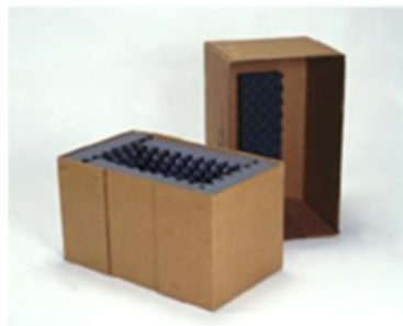
Figure 2-3: Multi-Application Container Examples

Multi-Application containers are designed to protect a variety of components within a given fragility and size range. Short life multi-application containers include "fast packs," consisting of a family of standard size cushioned fiberboard shipping containers of four types. A complete list of fast pack containers is in MIL-STD-2073-1 and is fully described in commercial standard PPP-B-1672. Packaging tests are not required when fast packs are selected. Seller is encouraged to use fast pack containers for the low labor costs of insertion and removal of items.