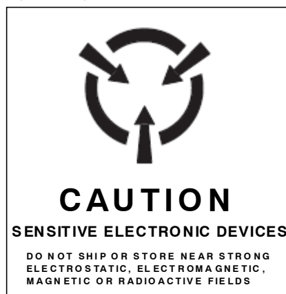
Figure 2. Electrostatic CAUTION Label

Apply WARNING Label (Figure 2) to each unit package containing a static sensitive device.