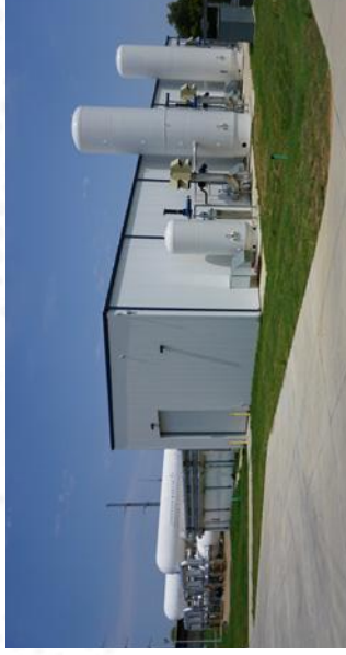
The High Speed Wind Tunnel is located in Dallas, Texas