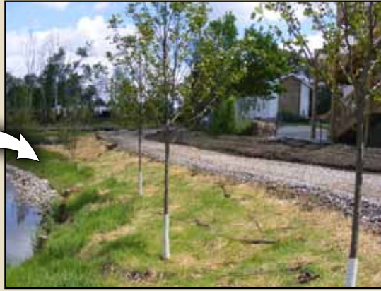
End of Hobart Avenue looking north.