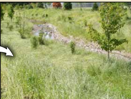
Salem Avenue at Landon Street looking south.