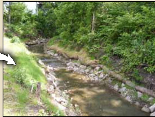
South end of the Sieberling Street culvert.