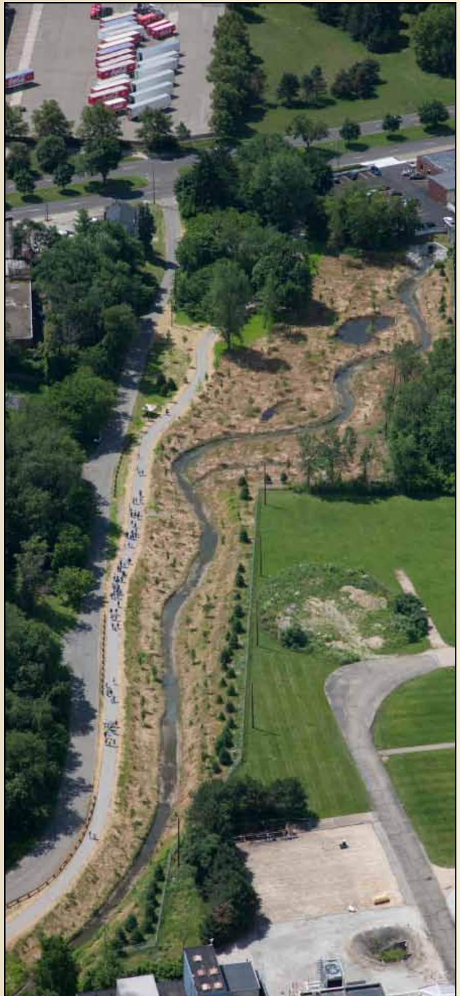
Southern end of Haley's Run taken on June 30, 2010