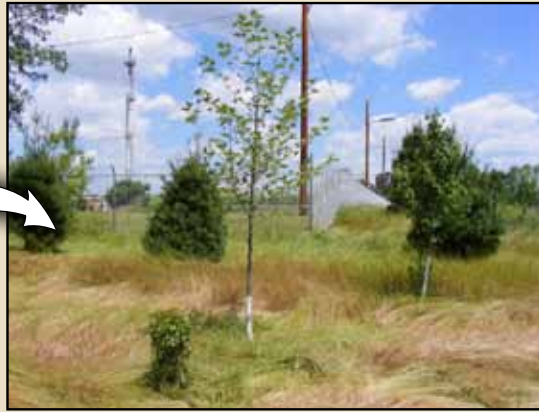
Salem Avenue easement east of Haley's Run looking north.