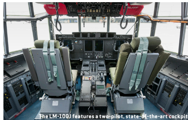
The LM-100J features a two-pilot, state-of-the-art cockpit.